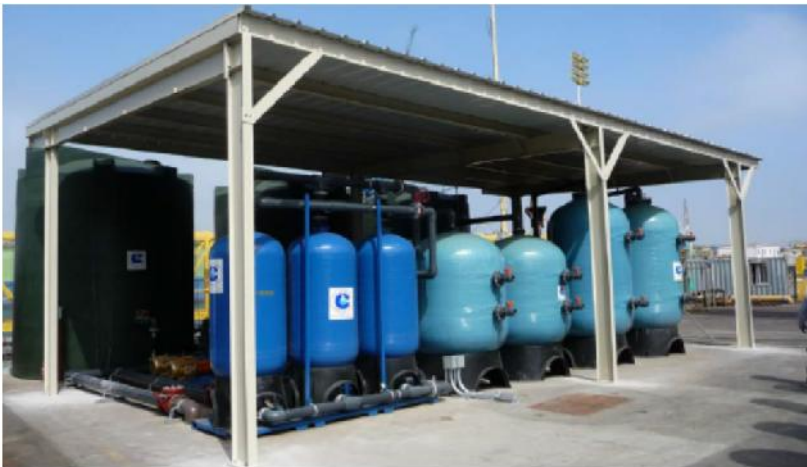
Target Pollutants: Copper, Zinc, Nickel and Cadmium San Diego Industrial Facility Features: 300 GPM Capacity | Discharge to Marine Waters

FOR SEDIMENT, TURBIDITY, HYDROCARBONS, BACTERIA, ORGANICS, METALS, OR ANY COMBINATION THEREOF, CLEAR CREEK SYSTEMS PROVIDES CLIENTS WITH THE BEST AND MOST COST EFFECTIVE SOLUTIONS TO THEIR WATER PROBLEMS.